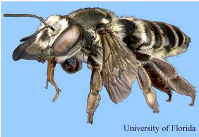
Figure 1. A leafcutting bee, Megachile sp.

Leafcutting bees are important native pollinators of North America. They use cut leaves to construct nests in cavities (mostly in rotting wood). They create multiple cells in the nest, each with a single larva and pollen for the larva to eat. Leafcutting bees are important pollinators of wildflowers, fruits, vegetables and other crops. Some leafcutting bees, Osmia spp., are even used as commercial pollinators (like honey bees) in crops such as alfalfa and blueberries.