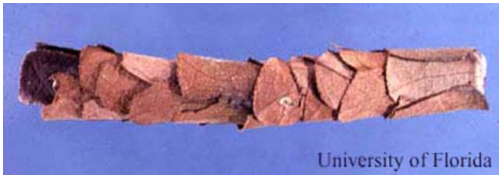
Figure 4. Nest of leafcutting bee pulled out of a cavity such as a hole in wood. This nest contains several cells; each cell will produce one adult leafcutting bee.

Most leafcutter bees overwinter in these nests as newly formed adults. In the following spring these adults chew their way out of the nest. Leafcutters are solitary bees and do not live in large groups or colonies like honey bees. Leafcutters do not aggressively defend nesting areas like honey or bumble bees. Their sting has been described as far less painful than that of a honey bee. Leafcutting bees will only sting if handled and therefore are not a stinging danger to people.