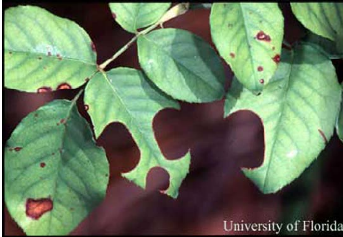
Figure 3. Typical leaf damage caused by leafcutting bees, Megachile spp. The bees use the leaf pieces to construct nests.

Leafcutting bees, as their name implies, use 0.25 to 0.5 inch circular pieces of leaves they neatly cut from plants to construct nests. They construct cigar-like nests that contain several cells. Each cell contains a ball or loaf of stored pollen and a single egg. Therefore, each cell will produce a single bee. Leafcutting bees construct these nests in soil, in holes (usually made by other insects) in wood, and in plant stems. A diversity of cavities, such as shells of dead snails, holes in concrete walls (like those produced for hurricane shutters) and other holes in man-made objects are used as nesting sites.